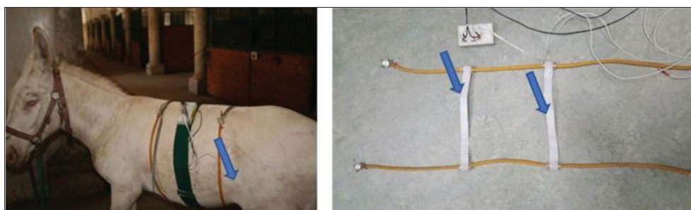
Fig 1. Sliding of the abdominal band towards the prepubic (flank) region causing decrease in circumferential movement. These tapes keep the tubes in a stable state

In this model, the healthy donkey group tended to have greater phase shift, with the thorax lagging behind the