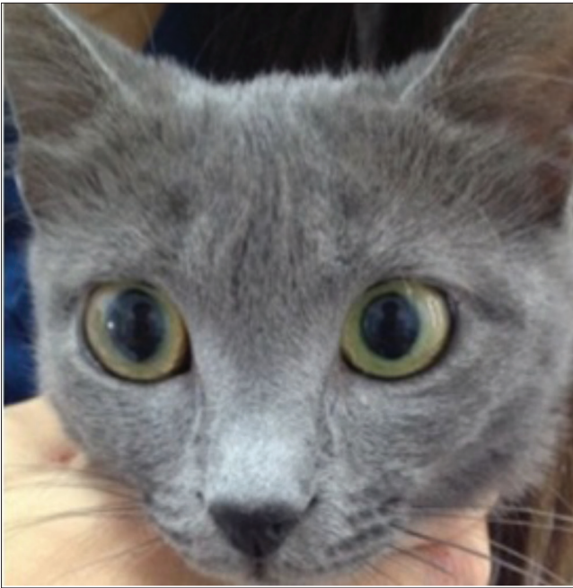
Fig 3. Recovery of the Horner's syndrome within one month post-operatively

operative treatment, it is recommended to perform traction and avulsion of the polyp through the ear canal or in a nasopharyngeal way. It was reported that corticosteroid (1 to 2 mg/kg/day for 14 days) in the postoperative period reduces relapse in cats by 11% [2,5]. VBO was recommended for operative treatment of polyps that originate from the middle ear [3]. Positive outcomes were obtained from the corticosteroid application following the traction-avulsion method, and no mid-term relapse was encountered.